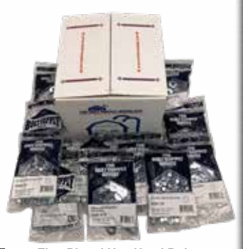
Zinc Plated Hex Head Bolts. Includes Bin Labels.

METRIC GRADE 10.9 BOLTS, NUTS, & WASHERS BSHM10.9A 2210pc M6-M12 BSHM10.9B 495pc M14-M20